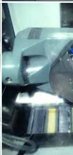
20 Setting up a machine centre with mounting towers.