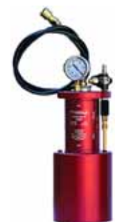
Pressure booster to activate the Stark fast closing clamp cylinder