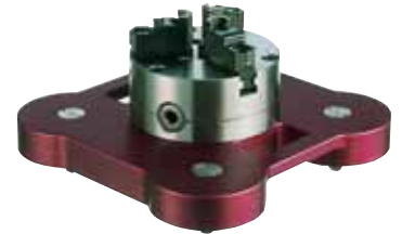
Pallet of draw-in type three-jaw chuck with handling grip