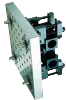
Breadboard pallet with flat tension frame