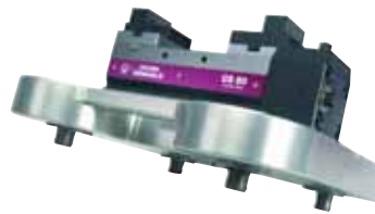
Vice pallet with handling grips