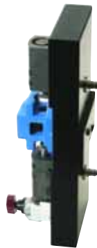
Special hydraulic actuated clamp module