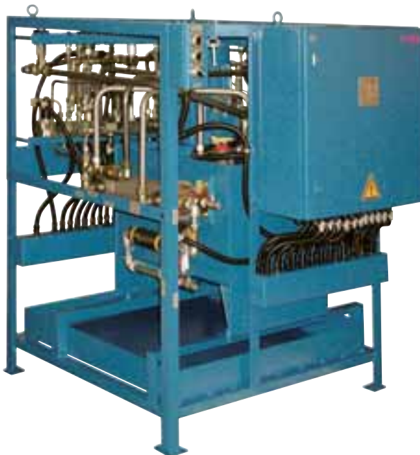
Frame-type power unit for 3 forging presses: 12 clamping circuits with pressure reduction for temperature compensation high pressure 4.2 l/min., 400 bar cooling return flow: 45 l/min., 10 bar